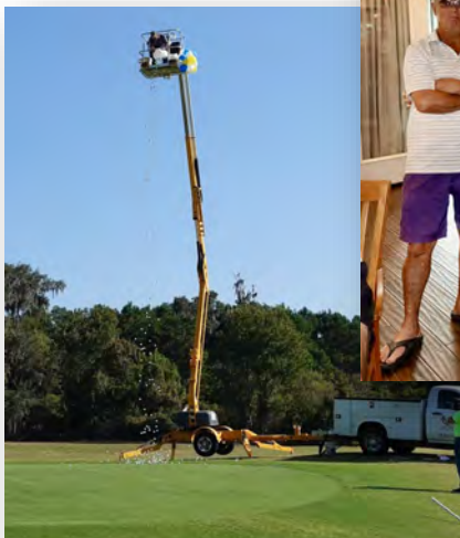
The golf ball drop at the Tournament Fore Success