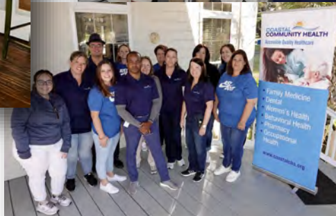
The staff at Coastal Community Health