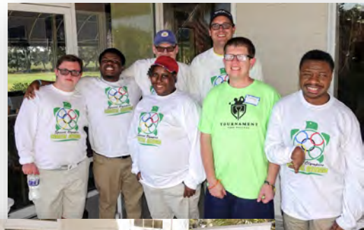
Visitors who are beneficiaries of the services of SOAR and Bridge-haven Academy