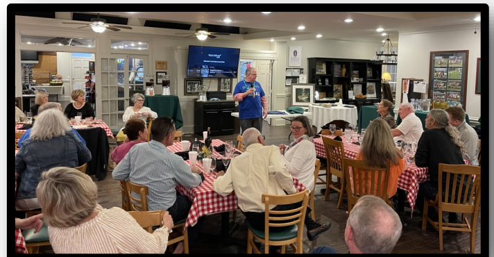
Owner/Member Irish Italian Dinner, March