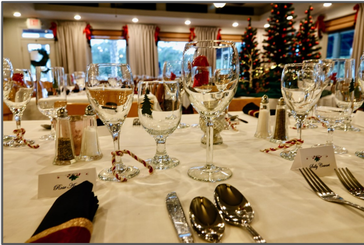
Annual Owner/Member Christmas Dinner, December