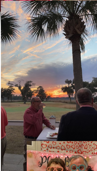
Owner/ Member Valentine's Dinner, February