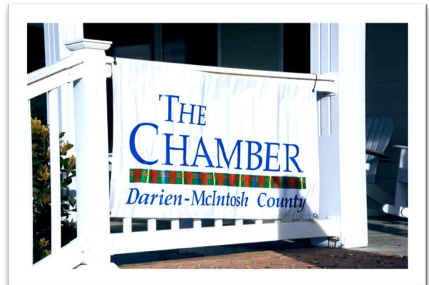
Chamber of Commerce Annual Golf Outing, March